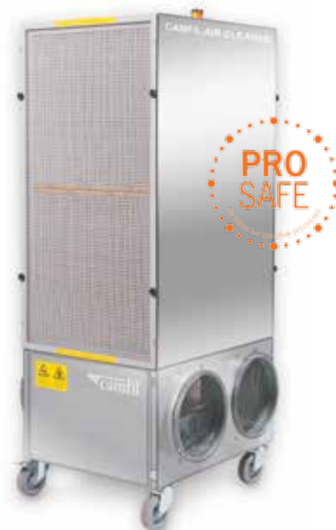
Air Cleaner CC 6000 Prosafe Art. number: 94020005