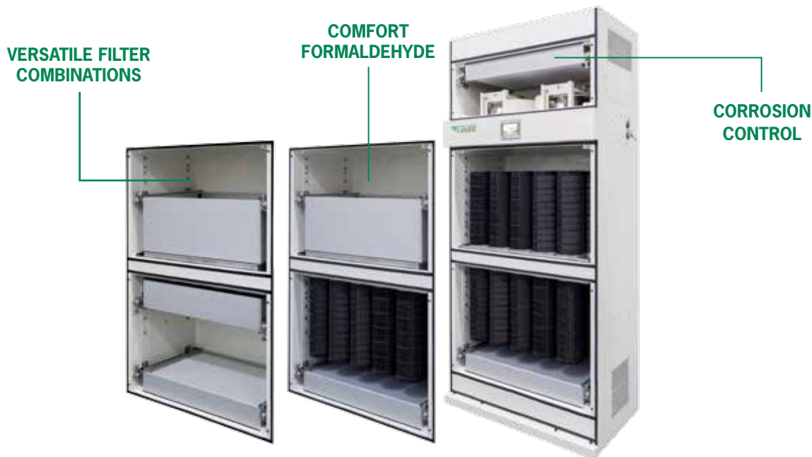
Air Cleaner CC 1700 & CC 2500 Art. number: 94000085 & 94000086

Versatile air cleaner specially engineered to provide clean indoor air. Especially suitable for these professional segments: Corrosion control, healthcare, comfort, life science, food & beverage.