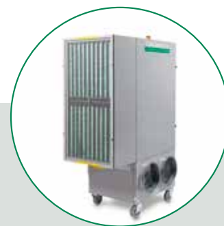
EXT. FRAME FOR BAGFILTER/ CITYCARB/CITY-FLO 592X592X MAX 370 (WITHOUT FILTER) Art. number: 9400010