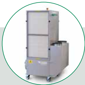
SILENCER (ONLY FOR VERTICAL MODEL), 1-2 PCS PER UNIT Art. number: 9400005