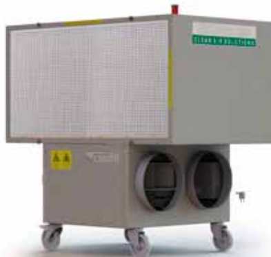
Air Cleaner CC 6000 Horizontal Art. number: 94000003 / 94000004