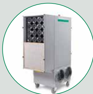
MOLECULAR BOX FOR 2X32 PCS CAMCARB CG 1300 INCL. 2 FRAMES (WITHOUT FILTER), 2 PCS PER UNIT Art. number: 9400035