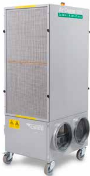
Air Cleaner CC 6000 Vertical Art. number: 94000001 / 94000002

Air Cleaner CC 6000 is engineered to help large logistic and manufacturing companies keep employees healthy, improve product quality and reduce dust.