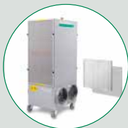
UPGRADE PRE-FILTER TO 97MM ECOPLEAT Art. number: 9400008