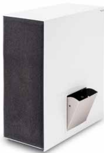
Air Cleaner CC 800 Art. number: 94000022

SUCTION SIDE (OUTDOOR CONNECTION), 1 PC PER UNIT Art. number: 94000025