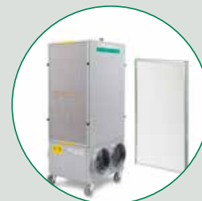
UPGRADE MAIN FILTER TO HEPA 13 Art. number: 9400009